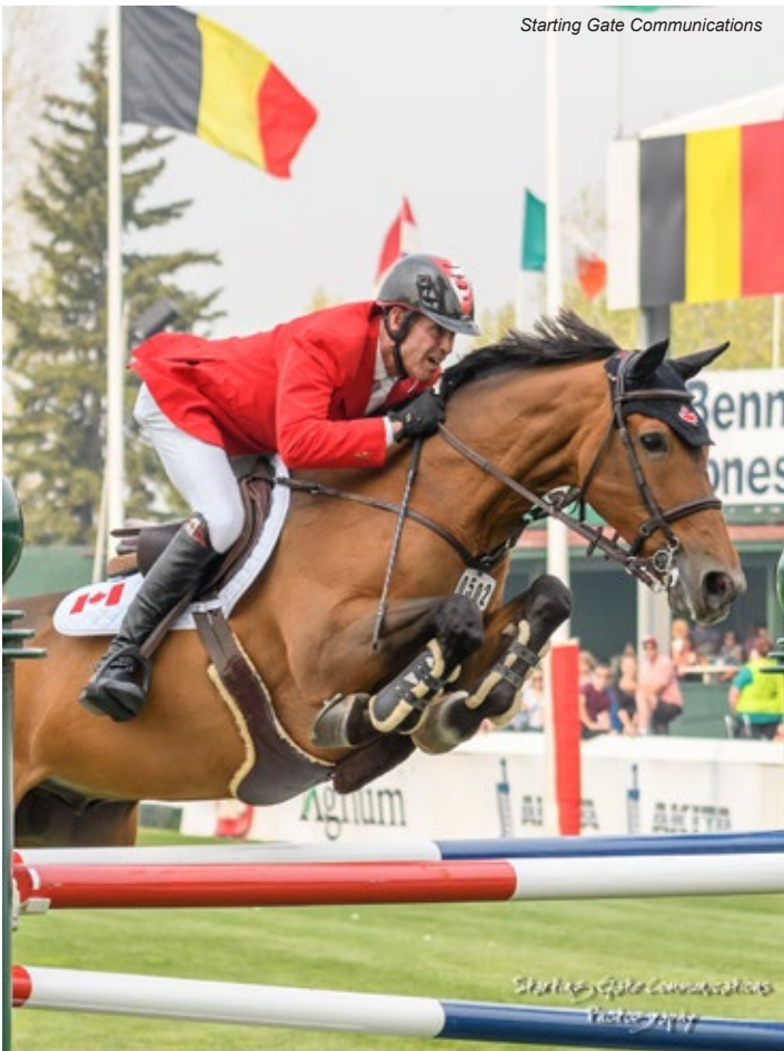
Starting Gate Communications