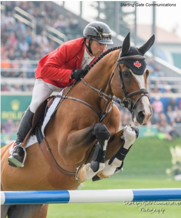
Starting Gate Communications