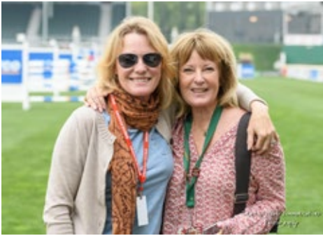
Canadian Olympian Beth Underhill and 1986 World Champion Gail Greenough

Calgary, AB