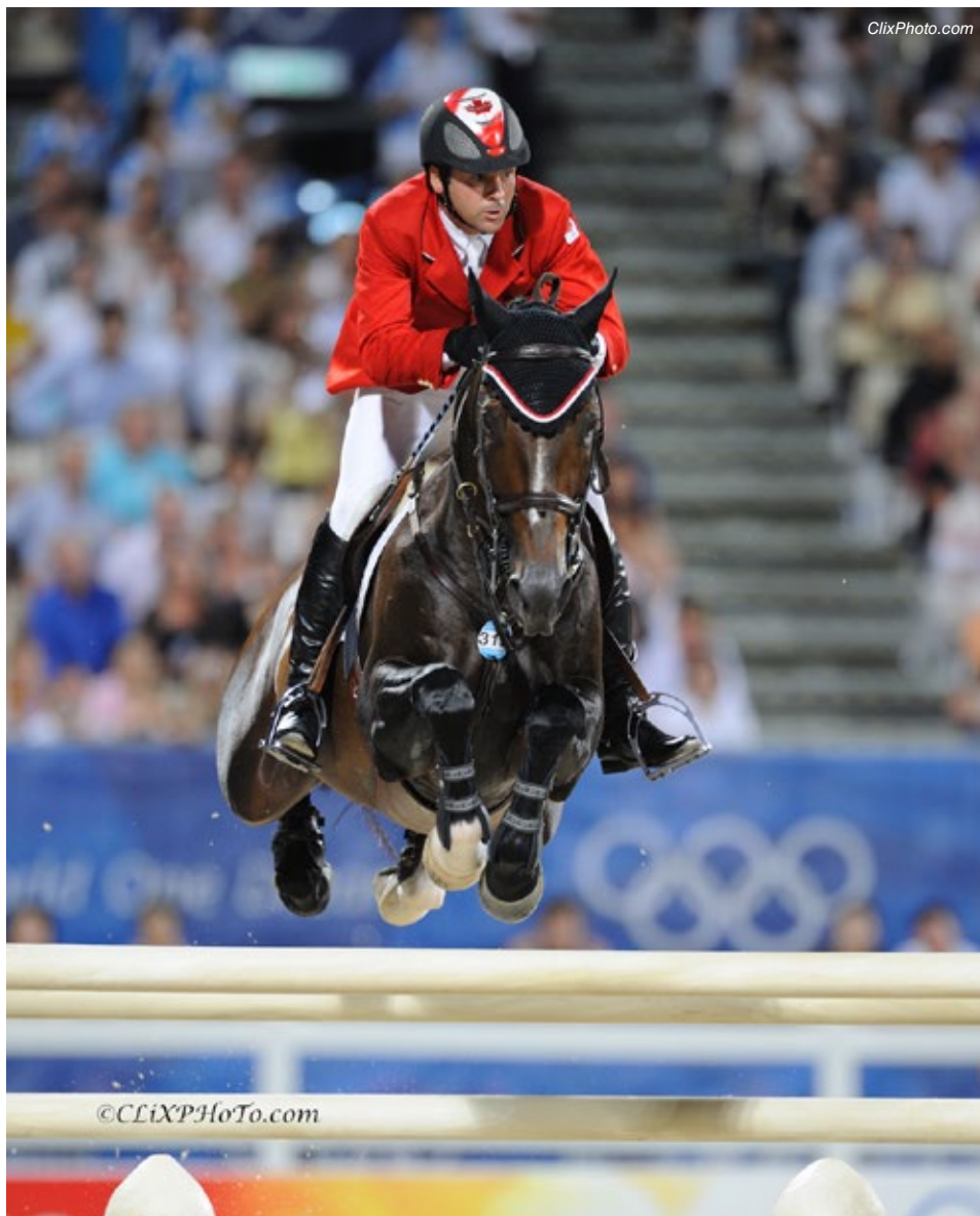
Beijing Olympic show jumping champions Eric Lamaze and Hickstead were inducted into Canada's Sports Hall of Fame on Sunday, October 3, 2021.

For more information on Canada's Sports Hall of Fame and the Order of Sport, visit www.sportshall.ca and www.orderofsport.ca .