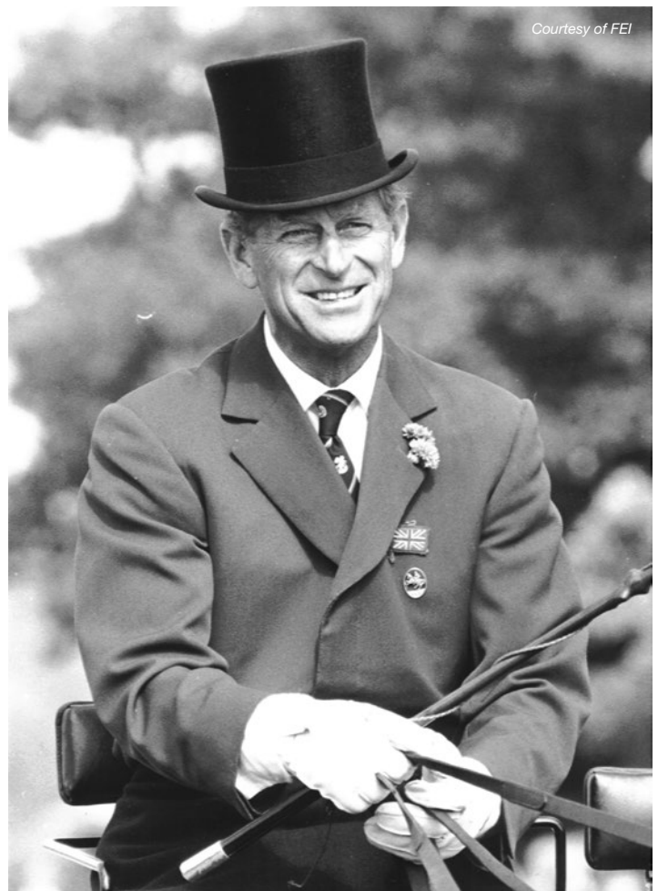
Prince Philip, the Duke of Edinburgh, the longest serving FEI President (1964 – 1986) passed away peacefully at Windsor Castle in England at the age of 99.

British Prime Minister Boris Johnson paid a fitting tribute to Prince Philip upon the news of his passing, saying, "Like the expert carriage driver that he was, he helped to steer the Royal Family and the monarchy so that it remains an institution indisputably vital to the balance and happiness of our national life."